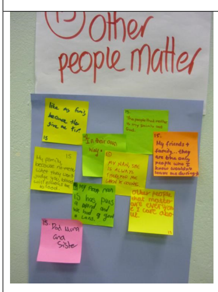
* 3:Thurrock pupils paper the walls with their wisdom