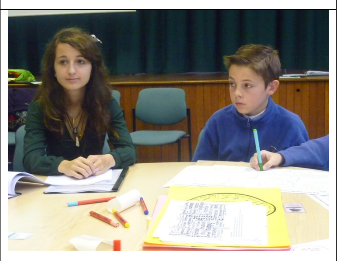
* 4:Ambassadors of faith and belief help pupils to find similarities and differences between religions